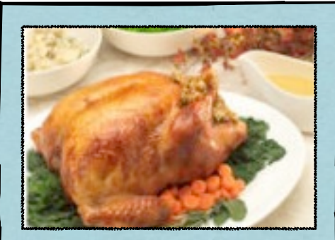
As we gear up for fall, we are reminded that Thanksgiving is coming up.