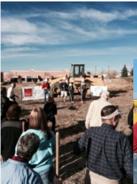
Photos from the ground breaking

Help the PTF when you shop at amazon.com . Sign up for AmazonSmile and they will donate .5% of your purchase to PTF. When prompted type in Parker Task Force for Human Services Charitable Trust.